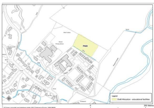
PN20 – expansion of Pannal Primary School