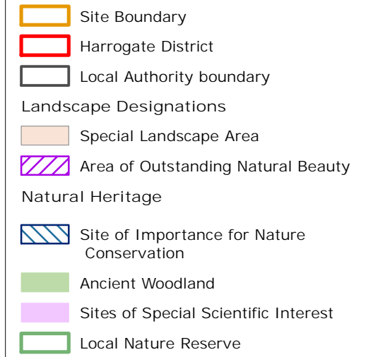
Figure 6b: Northeast Knaresborough