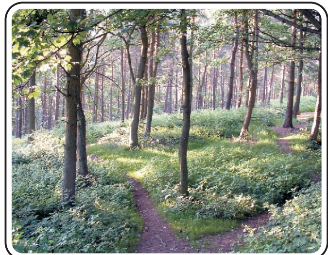
B The bridleway from Follifoot Road to the railway.

Although the area is influenced by the urban edge of Harrogate and Pannal there is little built form in the Character Area itself except for several scattered farmsteads. Crimple Valley is important to the setting of Harrogate and provides an essential green "rural corridor" separating Harrogate from the village of Pannal and others. It is highly valued by local residents.